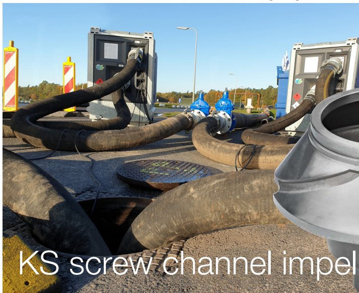
KS screw channel impeller

Air in the volume flow is no longer a problem. Further, if sand is present, you will now have much less wearing because the liquid is no longer guided along the cone.