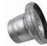
447 - Thread piece female (cup) - outer thread, galvanized