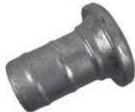
415 - Hose fitting (cup) galvanized