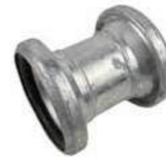
440 - Reversing piece female (cup - cup), galvanized