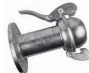
442 - Flange piece male (ball) - BBA, galvanized