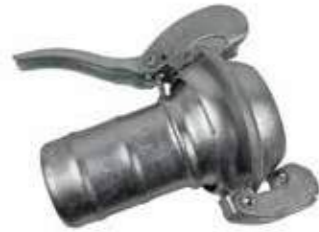
417 - Hose fitting (ball), galvanized