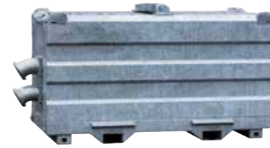
466 - Weir tank 10-23, galvanized