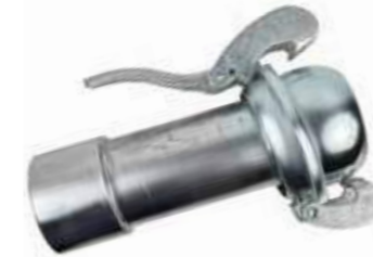
448 - Thread piece male (ball) - inner thread, galvanized