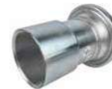
449 - Thread piece female (cup) - inner thread, galvanized