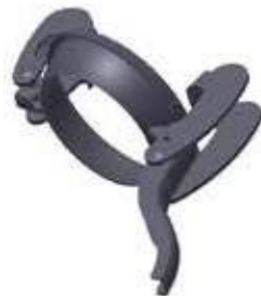
401 - Lever ring, black steel