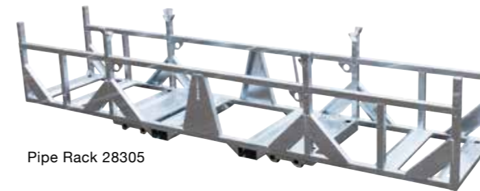
Pipe Rack 28305