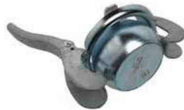
432 - End plug male (ball), galvanized