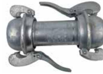
439 - Reversing piece male (ball - ball), galvanized