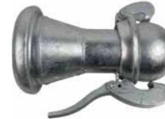
429 - Reducer - enlarger , galvanized