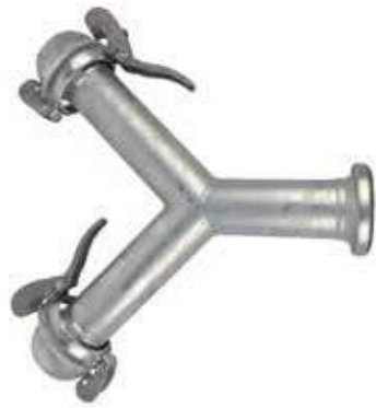
437 - WYE male (ball - ball - cup), galvanized