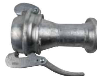
430 - Reducer - enlarger, galvanized