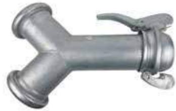
438 - WYE female (cup - cup - ball), galvanized