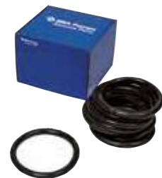
408 - O-ring rubber (set, 10 pieces)