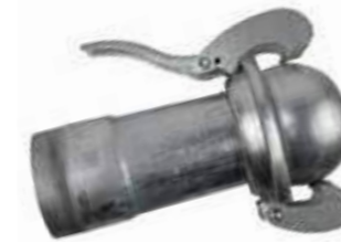
446 - Thread piece male (ball) - outer thread, galvanized