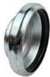
431 - End plug female (cup), galvanized